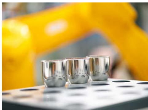
Repository for up to 20 crucibles

vable glass compositions have been discovered and explored to date. The production or introduction of new multi-functional glasses requires a long and expensive period of development.